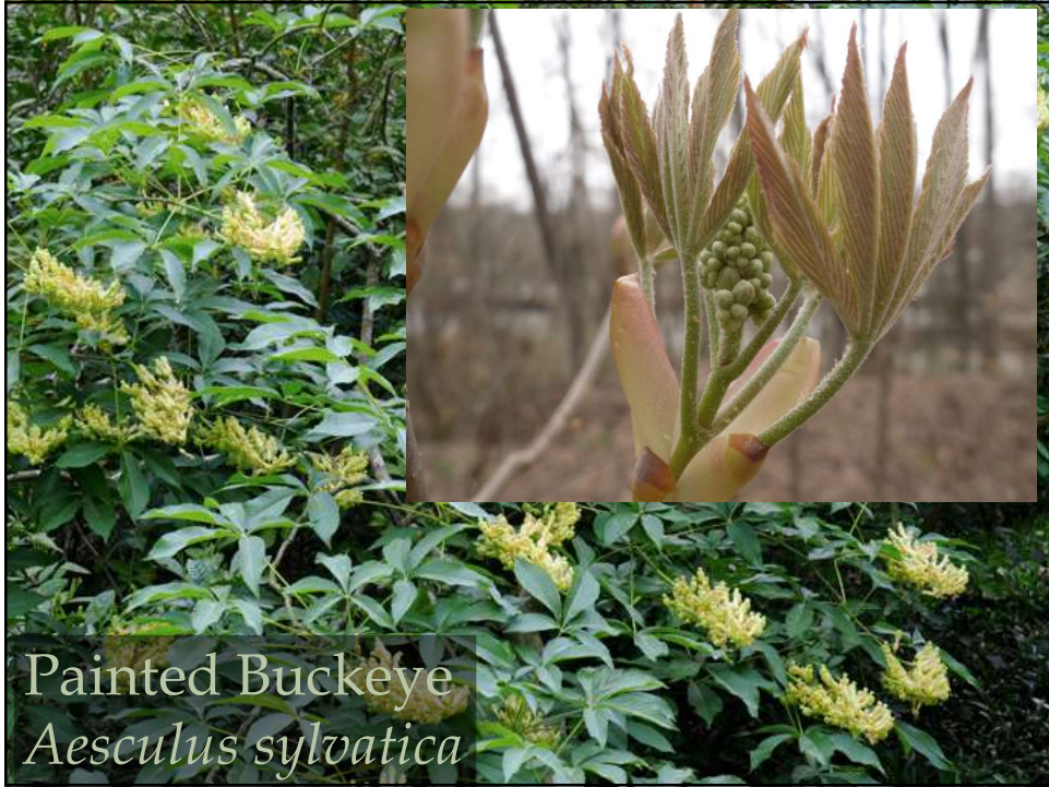
Painted Buckeye Aesculus sylvatica