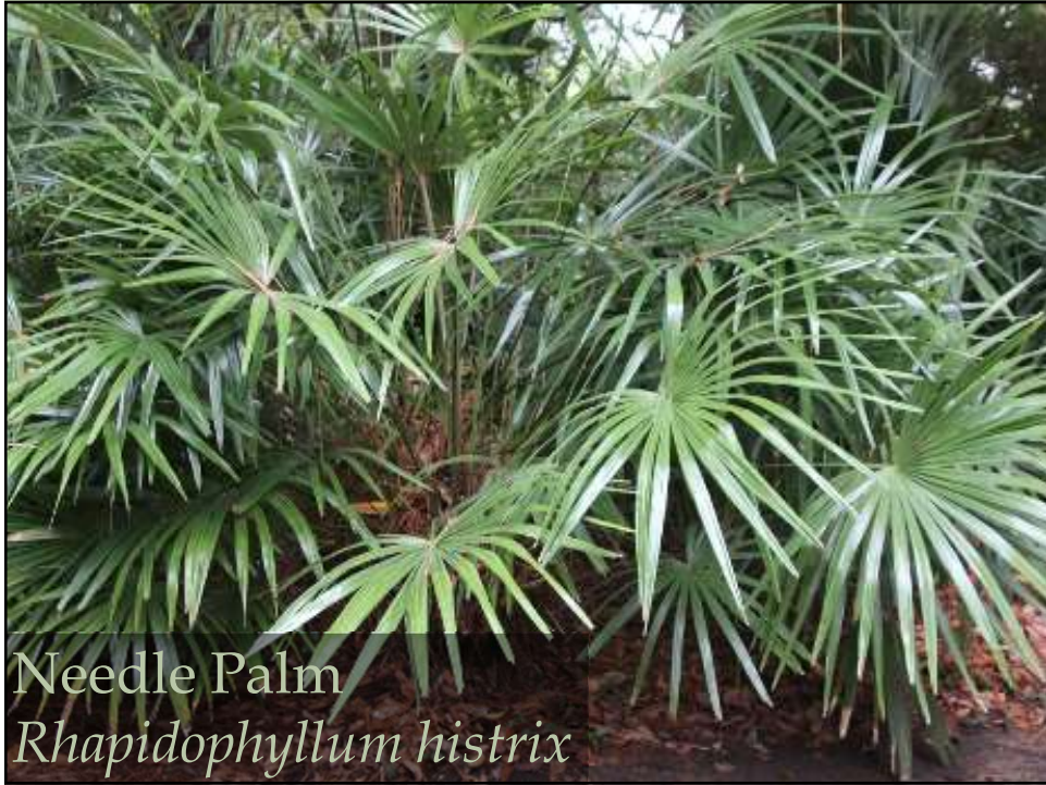
Needle Palm Rhapidophyllum hystrix