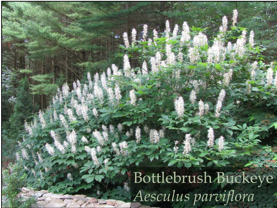
Bottlebrush Buckeye Aesculus parviflora