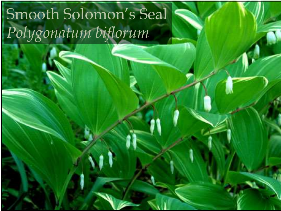
Smooth Solomon's Seal Polygonatum biflorum