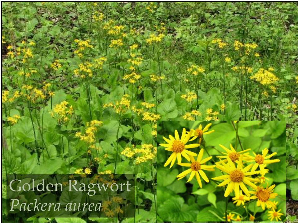
Golden Ragwort Packera aurea