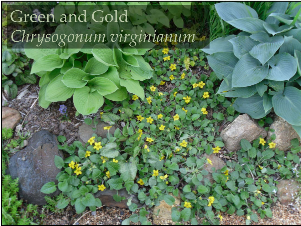
Green and Gold Chrysogonum virginianum