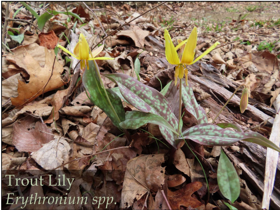
Trout Lily Erythronium spp.