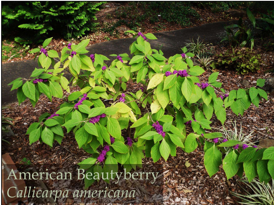
American Beautyberry Callicarpa americana