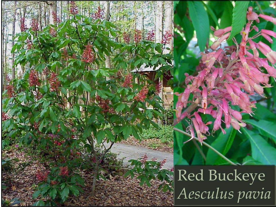
Red Buckeye Aesculus pavia