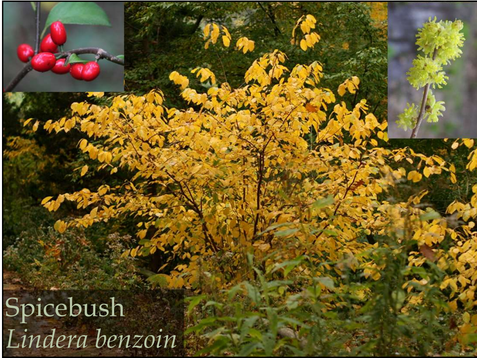
Spicebush Lindera benzoin